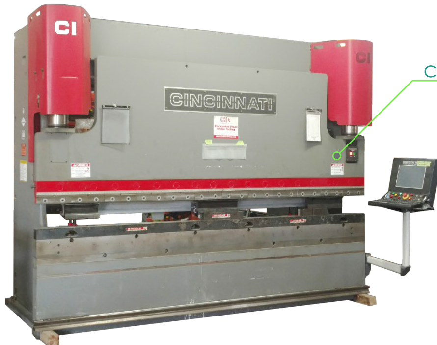
CINCINNATI 175 Ton Press Brake