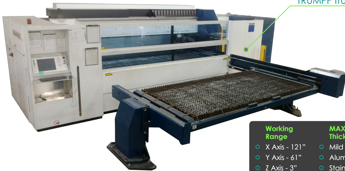
TRUMPF TruLaser 1030